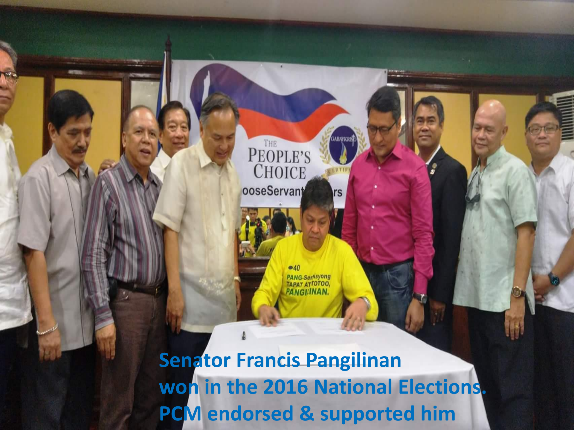
Senator Francis Pangilinan won in the 2016 National Elections. PCM endorsed & supported him