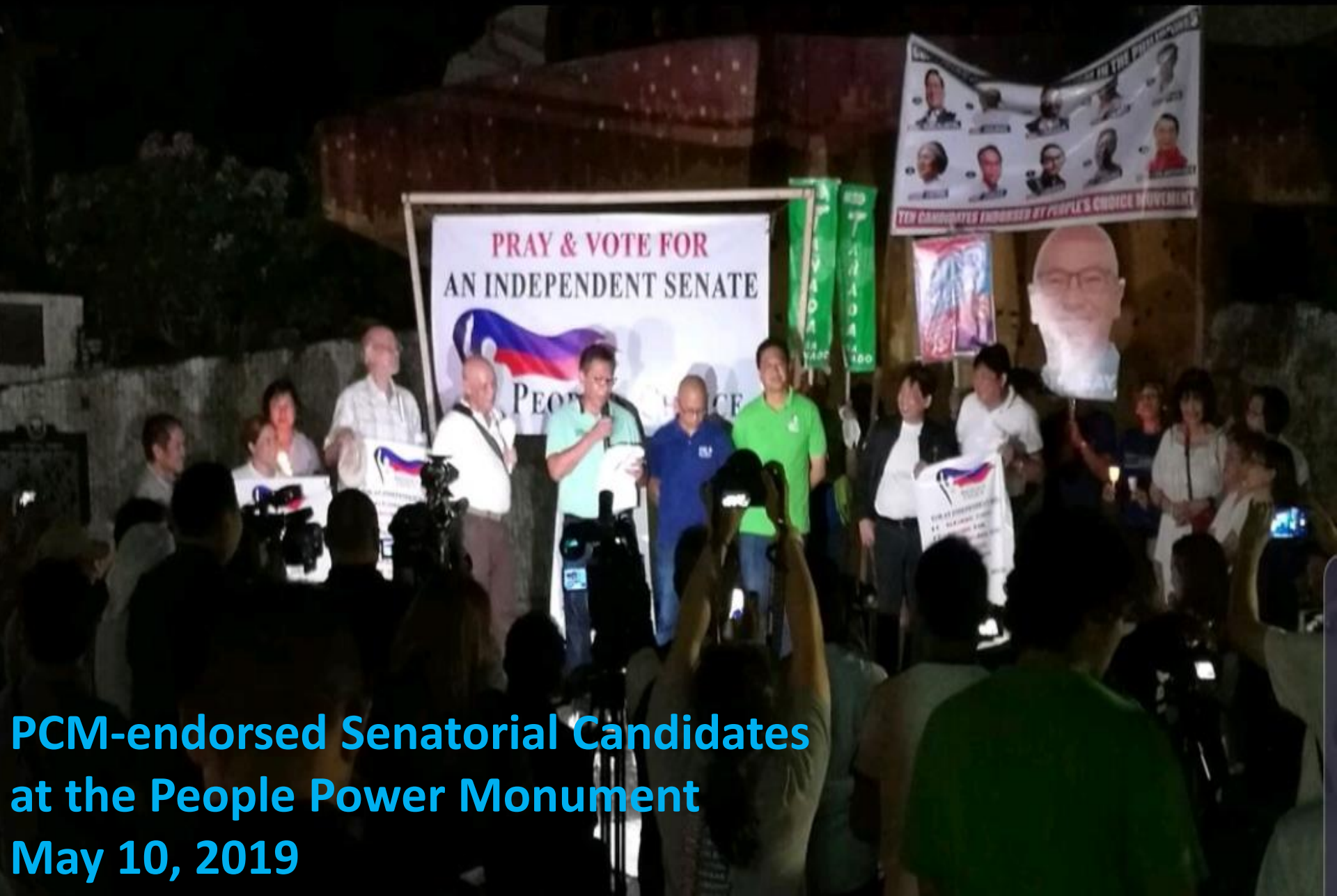
PCM-endorsed Senatorial Candidates at the People Power Monument May 10, 2019